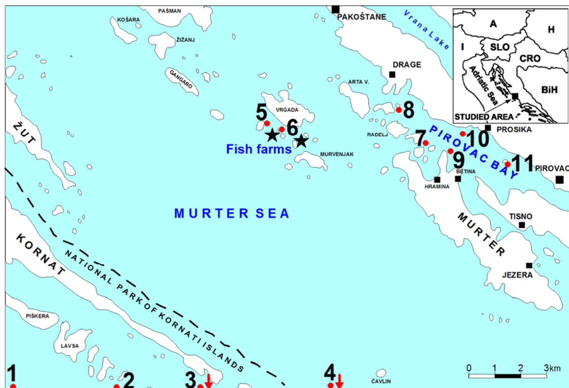
Figure 1. Map of the study area in Murter Sea and Pirovac Bay (Central Adriatic) showing sampling sites.

The individuals of acorn barnacles of B. perforatus were collected by scuba diving from the sea at a depth of up to 1 m at five localities in the semi-enclosed Pirovac Bay (sampling sites PB 7-11, Fig. 1), highly impacted by the human sewage effluents from the septic systems, as well as at the pristine off-shore reference site (Lumbarda Reef Flat, sampling site ROFF - 1) and at three other isolated offshore reef flats (Puh, Balun and Dužac Island, sampling sites ROFF 2-4), which were not affected by human activities. The B. perforatus samples were collected from the same depth also around the small isolated Islands of Špinata and Rakita (sampling sites FF 5 and 6) close to the fish farm at Vrgada Island, with an annual production of about 450 t of sea bass ( Dicentrarchus labrax ) and sea bream ( Sparus aurata ) and 1000 t of tuna ( Thunnus thynnus ).